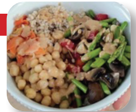
Good for the Gut Grain Bowl