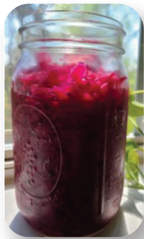
Sauerkraut