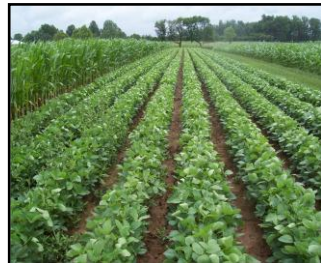
Pastureland (left) versus tilled row cropland (right).

Pasture types represented dairy, beef, equine, and poultry. Row crops included mostly corn and soybean, and sometimes vegetable crops. Each pasture sample was paired to a row-crop sample based on proximity and similarity of soil type.