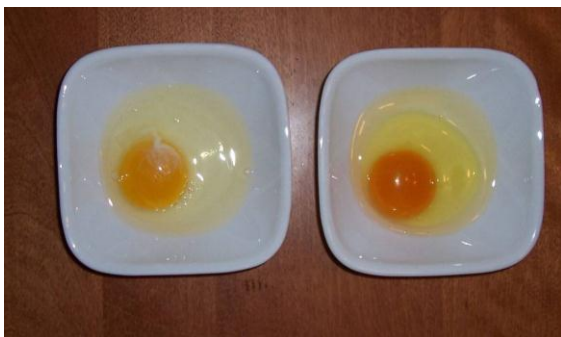
Conventional egg (left) with yellow yolk versus a pasture raised egg (right) with orange yolk.

A compelling feature of pasture farming is that meat, milk, and eggs produced by animals that graze on pasture have higher concentrations of vitamins and healthful fats. Differences in food quality are sometimes visually apparent as in the case of eggs from chickens in confinement versus pasture as illustrated below. Thus, pasture farming builds both soil fertility and food nutrient density.